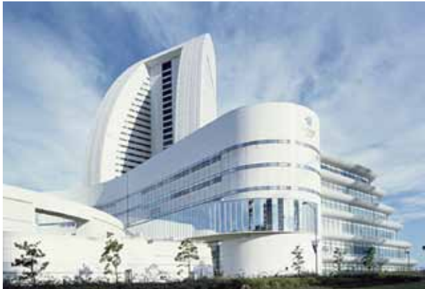
PACIFICO Yokohama Exhibition Hall A,B,C

2015 8-10, Oct, YOKOHAMA 2016 22-24, Sep, YOKOHAMA