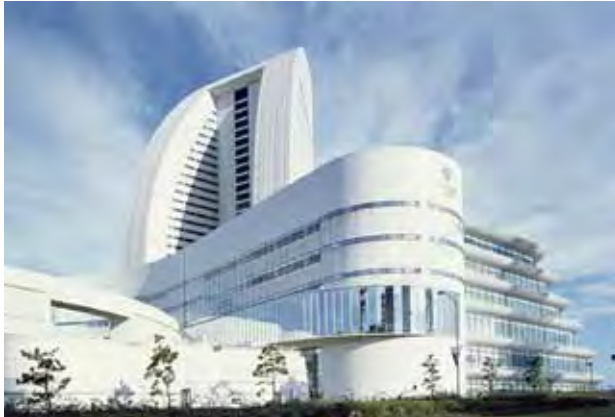
PACIFICO Yokohama Exhibition Hall A,B,C

2015 8-10, Oct, YOKOHAMA 2016 22-24, Sep, YOKOHAMA